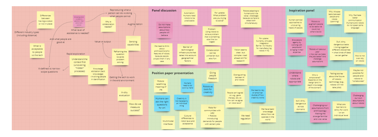
Fig. 3. A sample of notes taken by organisers.